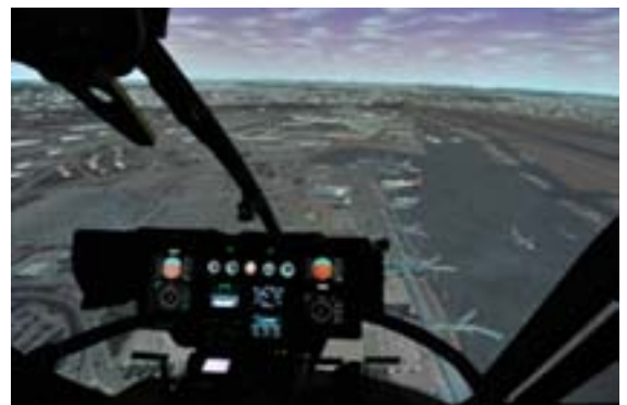
Figure 1 : FNPT Main Features