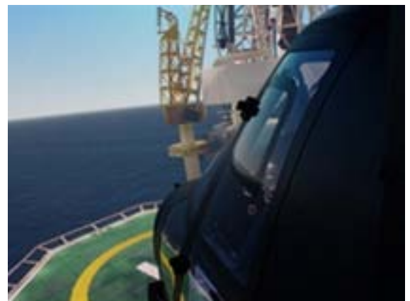
Figure 3 : FFS Main Features