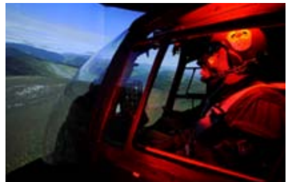
Figure 2 : FTD Main Features